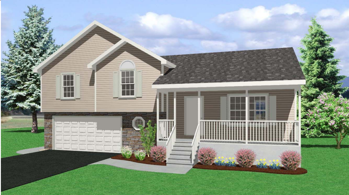
Living Area - 1,482 sq ft. Garage - 589 sq. ft.